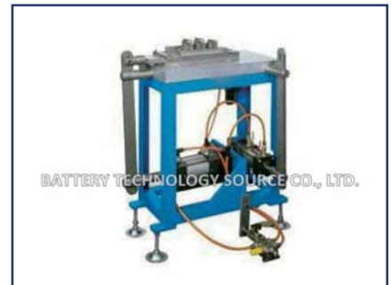
HP-10C Manual car battery hole punching machine