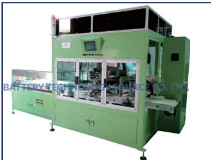
BPD-10AC Automatic hole punching and dumping machine