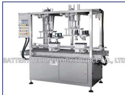
PB-20AC Automatic post brushing machine