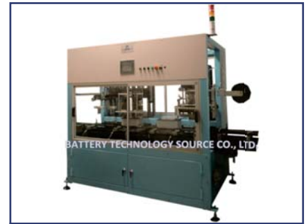
AH-20AC Automatic foil sealing machine