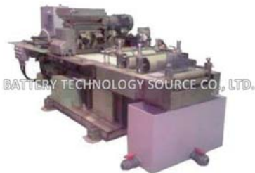
BPP-10ACM Automatic plate pasting machine