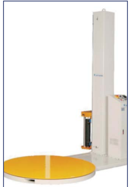
WSV-1521, 1821 Automatic vertical wrapping machines