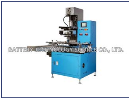
AT-10AC Automatic leak test machine