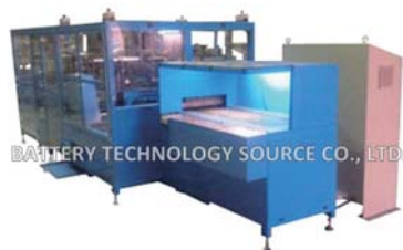
BSB-3S Automatic lug brushing and plate slitting machine