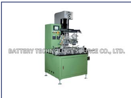
AT-20AM Automatic top cover leak test machine