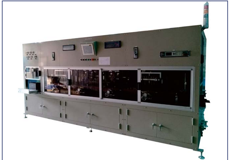
HPVRT-40AC Automatic short-circuit test, inter-cell welding, short-circuit test and weld quality check (internal resistance test) machine