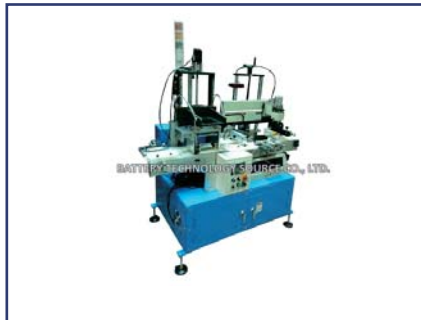
BSP-10AM Automatic screen printing and container rotating machine