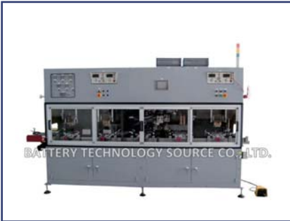
HV-50AM Auto. polarity/S-C test, ICW and IR test machine