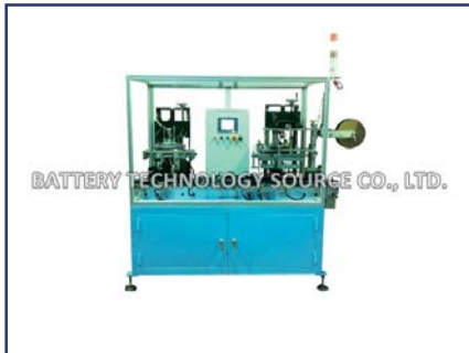
AHS-20AM Automatic aluminum foil top and side sealing machine