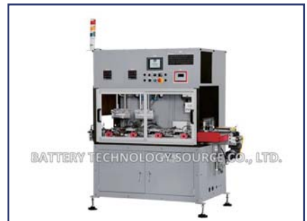
ATC-30AM Automatic leak test and coding machine