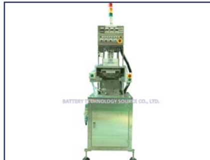
HM-10MS Semiautomatic top cover heat sealing machine