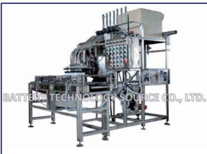
BCM-AF10AC Automatic acid filling machine