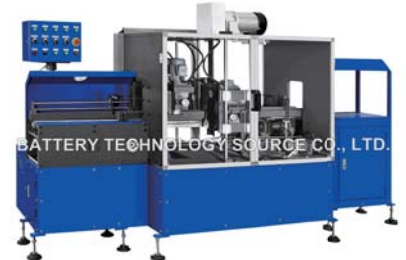
BFB-40AM Fully automatic 4 side frame brushing machine