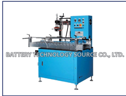
AC-10AC Automatic code engraving machine