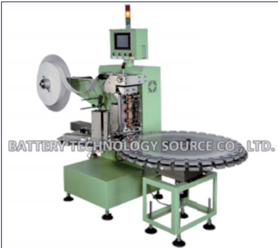
VGM-20M Semi-automatic AGM separator wrapping machine