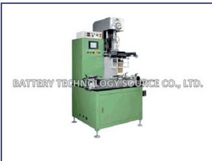
HPVT-10AM Automatic polarity and short- circuit test machine