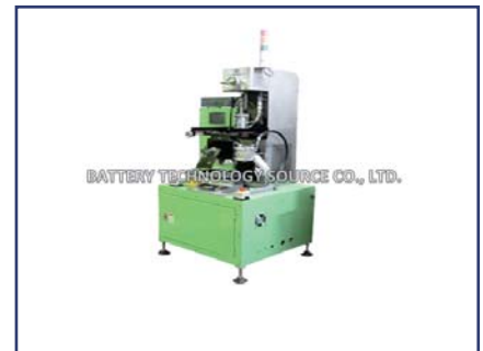
HV-20M Semi-automatic inter-cell welding machine