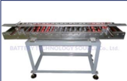
HY-10AC Motorized rolling conveyor