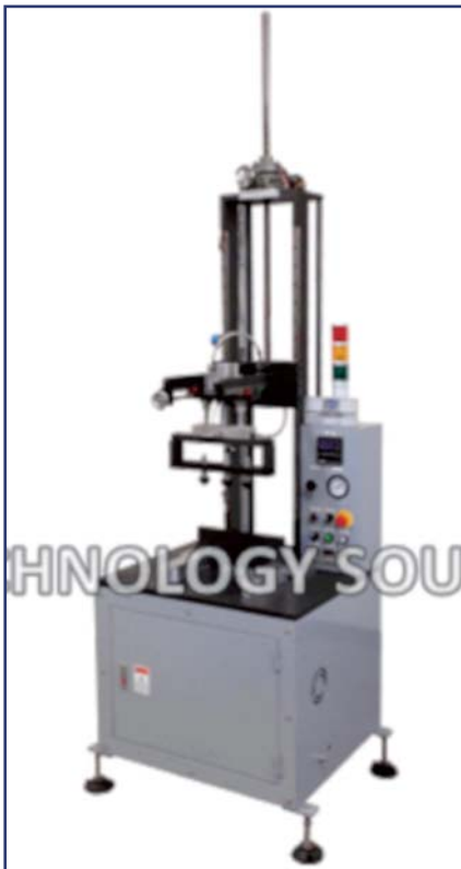
AT-10C Semiautomatic leak test machine