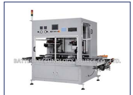
AT-20AC Automatic leak test machine