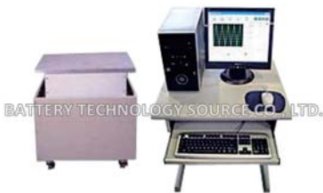
VS-560M Reactive type vibration tester