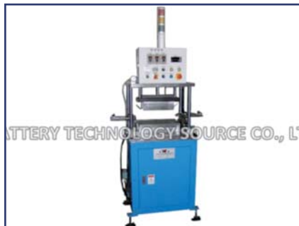
ATS-10C Semiautomatic top cover leak test machine