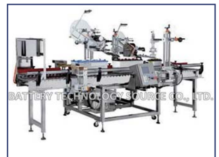
BL-20AC Automatic battery labeling machine