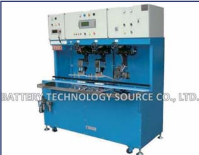
BHRD-300RDS(AM) Microcomputer controlled battery inspection machine