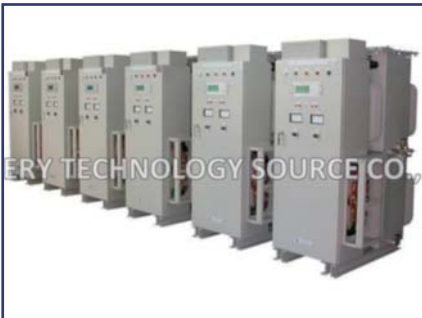
BTS-NCC200/350S Battery charger with microcomputer control