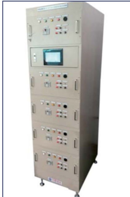
NT6CCDR20/50 Multi-function charger and discharger