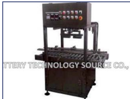
BCP-10ACS Automatic top cover pressing machine