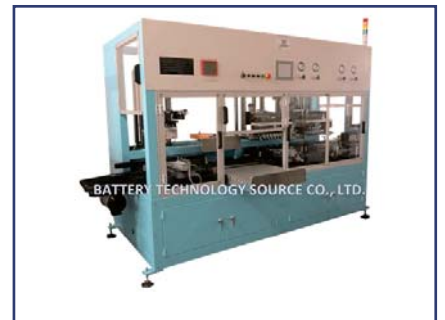
ATC-30AC Automatic leak test and coding machine