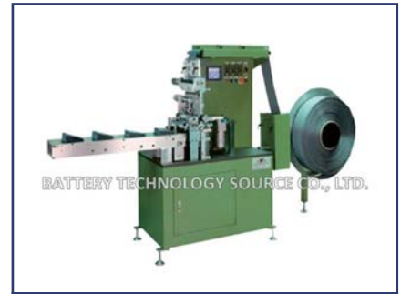
HEP-10AC Automatic PE separator wrapping machine