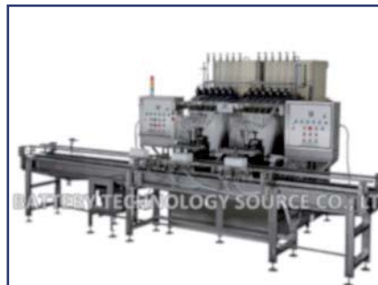
BCM-AF20AC Automatic acid filling machine