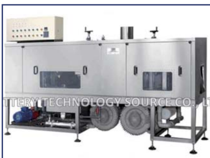
BWD-10AC Automatic battery washing machine