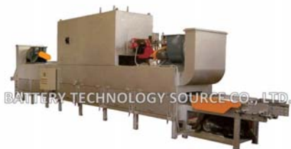
FDO-10 Horizontal flash drying oven