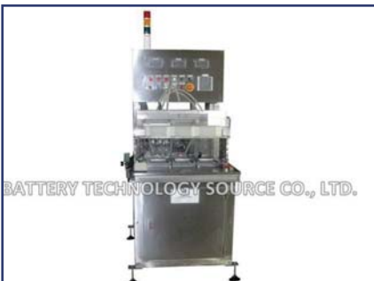
AF-30MS Semi-automatic acid filling machine