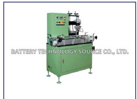
AC-10AM Automatic code engraving machine