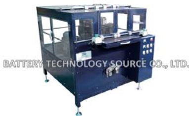
BFB-10AM Semi-automatic 3 side frame brushing machine