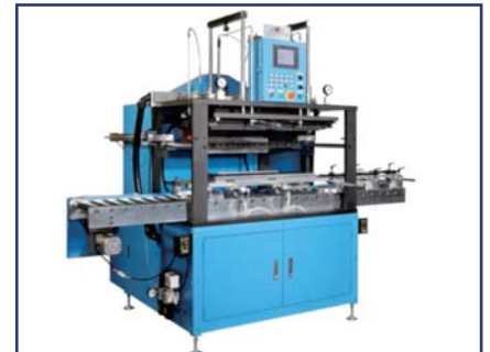
HM-10ACS Automatic secondary cover heat sealing machine