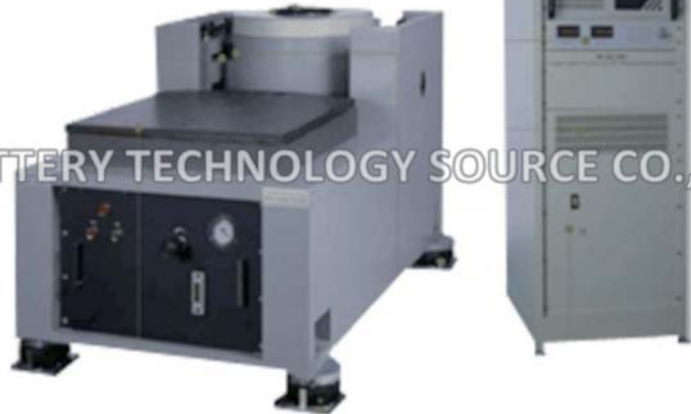
VS-600VH Electrodynamic vibration testing system