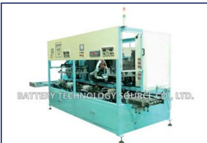
HPVT-40AC Automatic polarity/S-C test, ICW and IR test machine