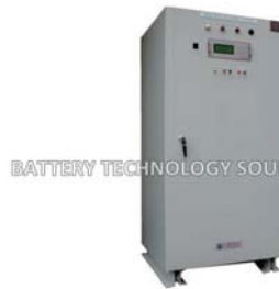
NTHDR20-2000 Multi-function discharge tester