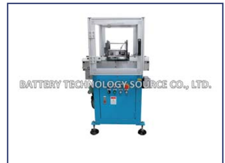
BD-10AM Automatic battery dumping machine