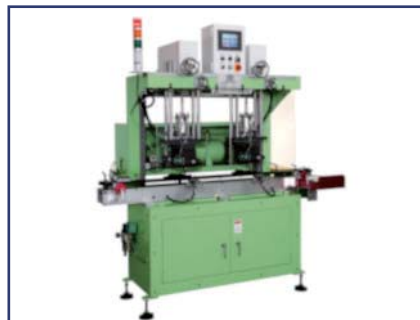
SRT-20AM Automatic shear test and IR test machine