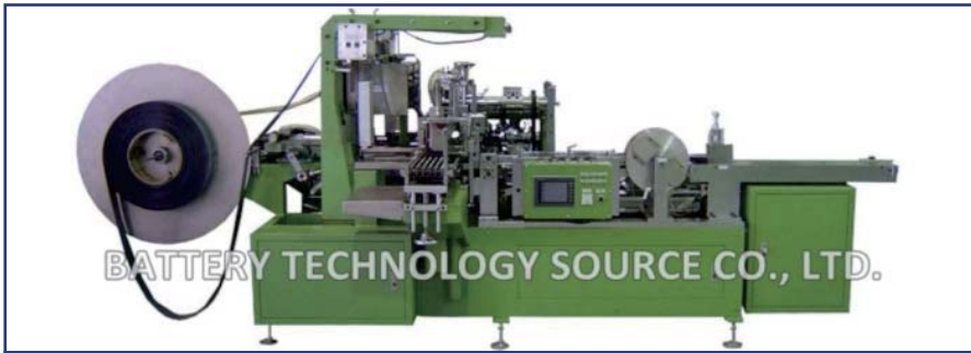
PE-20AC Fully automatic PE separator enveloping machine