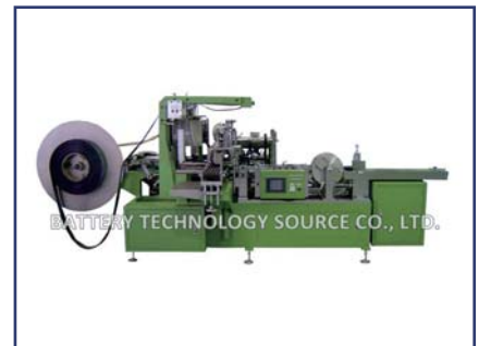
PE-20AM Fully automatic PE separator enveloping machine