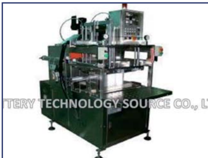
HM-10CS Semiautomatic top cover heat sealing machine