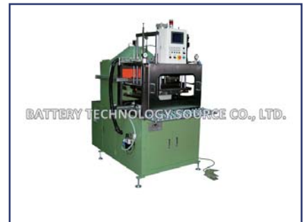
HM-10C Semi-automatic heat sealing machine