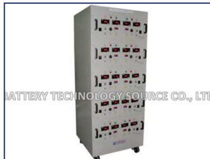
BTS-10C-300/1 Automatic charger (10 circuits)