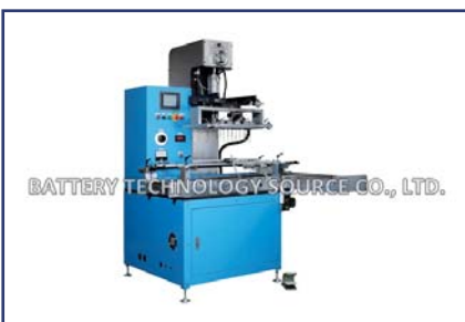
HPVT-10AC1 Polarity and short circuit test machine