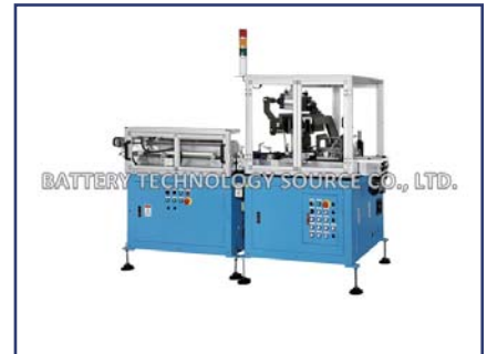
BPD-10AM Automatic hole punching and dumping machine