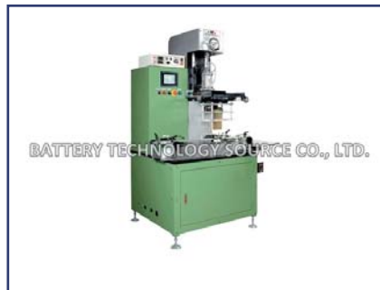
HVT-10AM Automatic short-circuit test machine