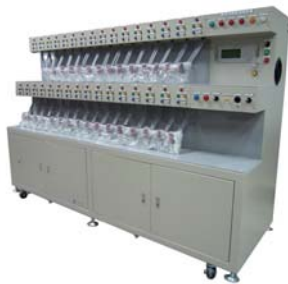
NTCDR230/80 BP-16CH-5C Capacity testing system