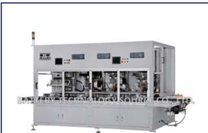
HPVT-60AC Automatic polarity/S-C test, ICW and S-C test machine