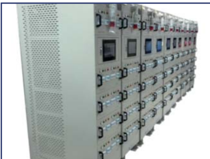
NT10CCD-300/3 Multi-function charger and discharger