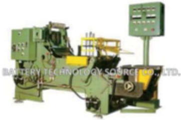
BGC-10C Automatic grid casting machine