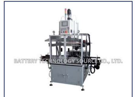
HM-10AC Automatic heat sealing machine