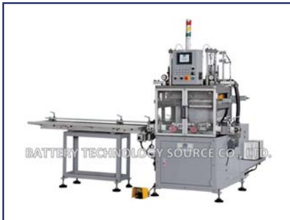
HM-10AMS Automatic top cover heat sealing machine