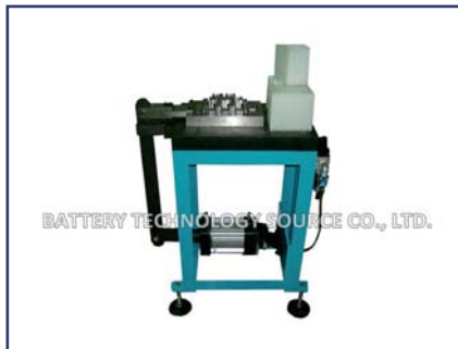
HP-10M Manual motorcycle battery hole punching machine