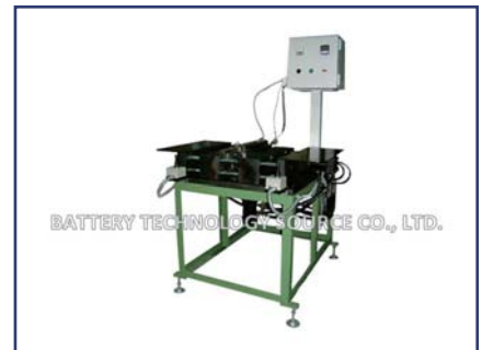
PCS-20H Semi-auto. small lead parts casting machine (hydraulic)