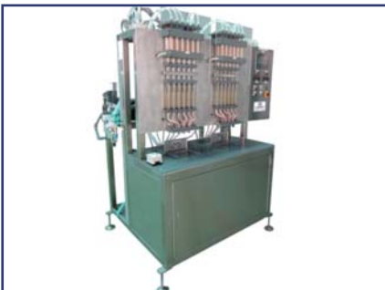
AF-40MS Semi-automatic acid filling machine