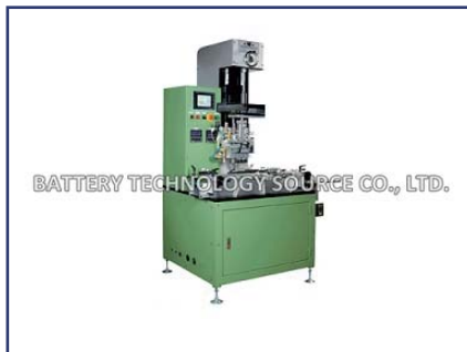
AT-10AM Automatic leak test machine