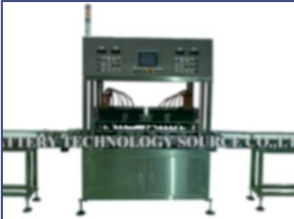
AF-40AMS Automatic acid filling machine