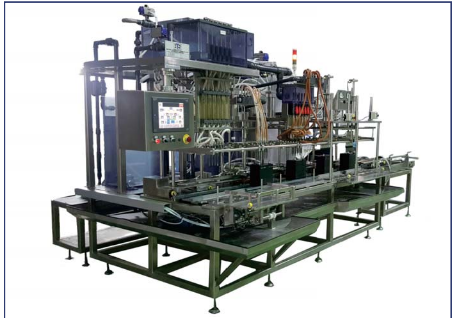
AFT-50AC Automatic acid filling, leveling and leak testing machine