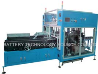
GPC-30AC Fully automatic plate cutting machine