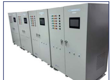
NT6CCDR300/50 Multi-function charger and discharger