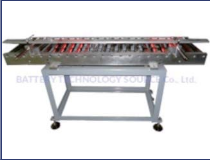
HY-10AM Motorized rolling conveyor