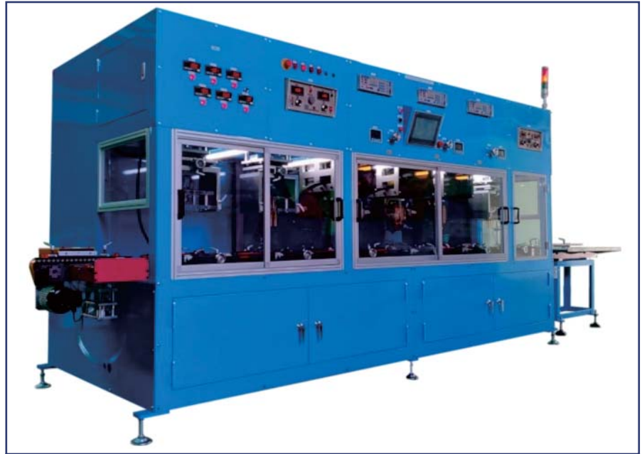
HV-60AM Automatic polarity/short-circuit test, inter-cell welding and internal resistance test (weld quality check) machine