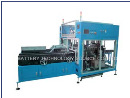
GPC-20AC Fully automatic plate cutting machine