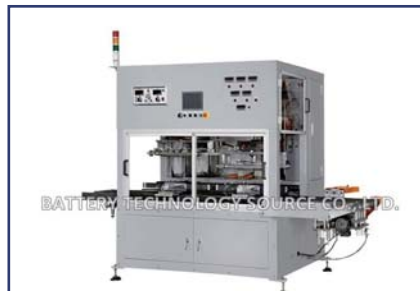
IRV-20AC Automatic S-C test and internal resistance test