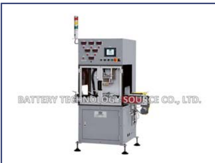
IRT-10AM Automatic internal resistance test machine