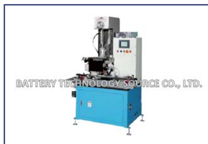
HV-20AC Automatic inter-cell welding machine