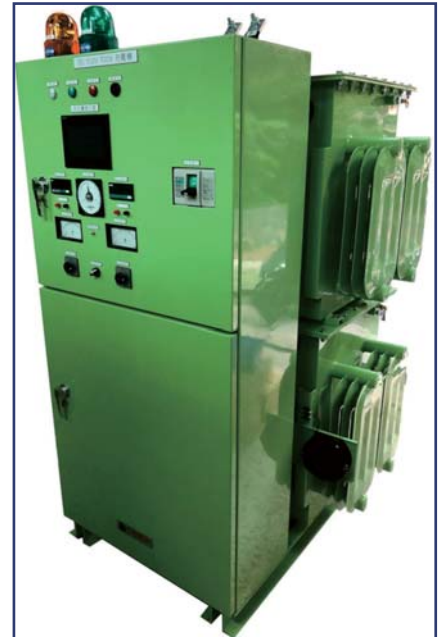
NTFCCR-150/700 Automatic charger (10 circuits)