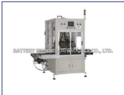
TPB-10AC Automatic pole burning machine