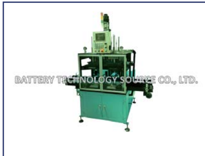
HM-20AC Automatic heat sealing machine