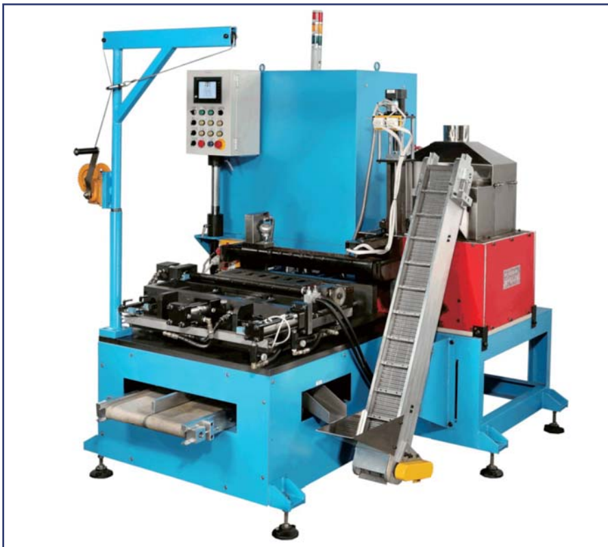
PCS-20ACH Automatic small lead parts casting machine