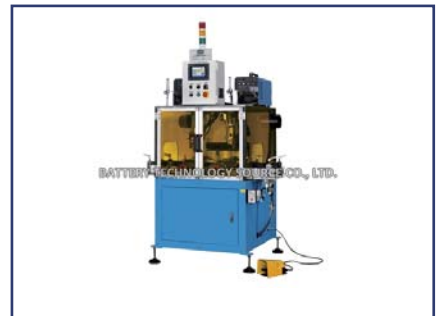
TIG-10AM Automatic TIG welding machine