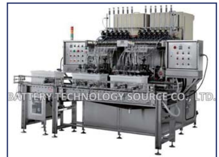
BCM-AFL20AC Automatic acid leveling machine