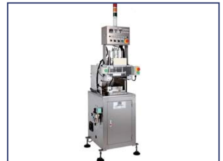
LT-10M Semiautomatic vent strip leak test machine