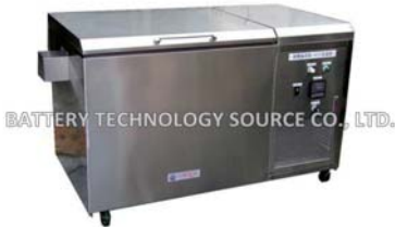
BTS-LT403T Low temperature box