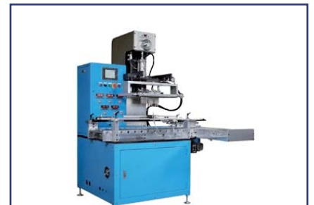
IRT-10AC Automatic internal resistance test machine