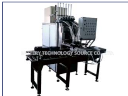
BCM-AFL10AC Automatic acid leveling machine