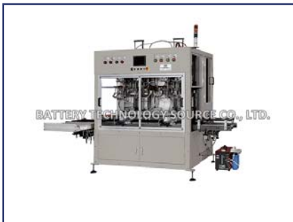
TPB-20AC Automatic pole burning machine