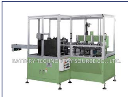
PS-40AM Automatic lug brushing machine