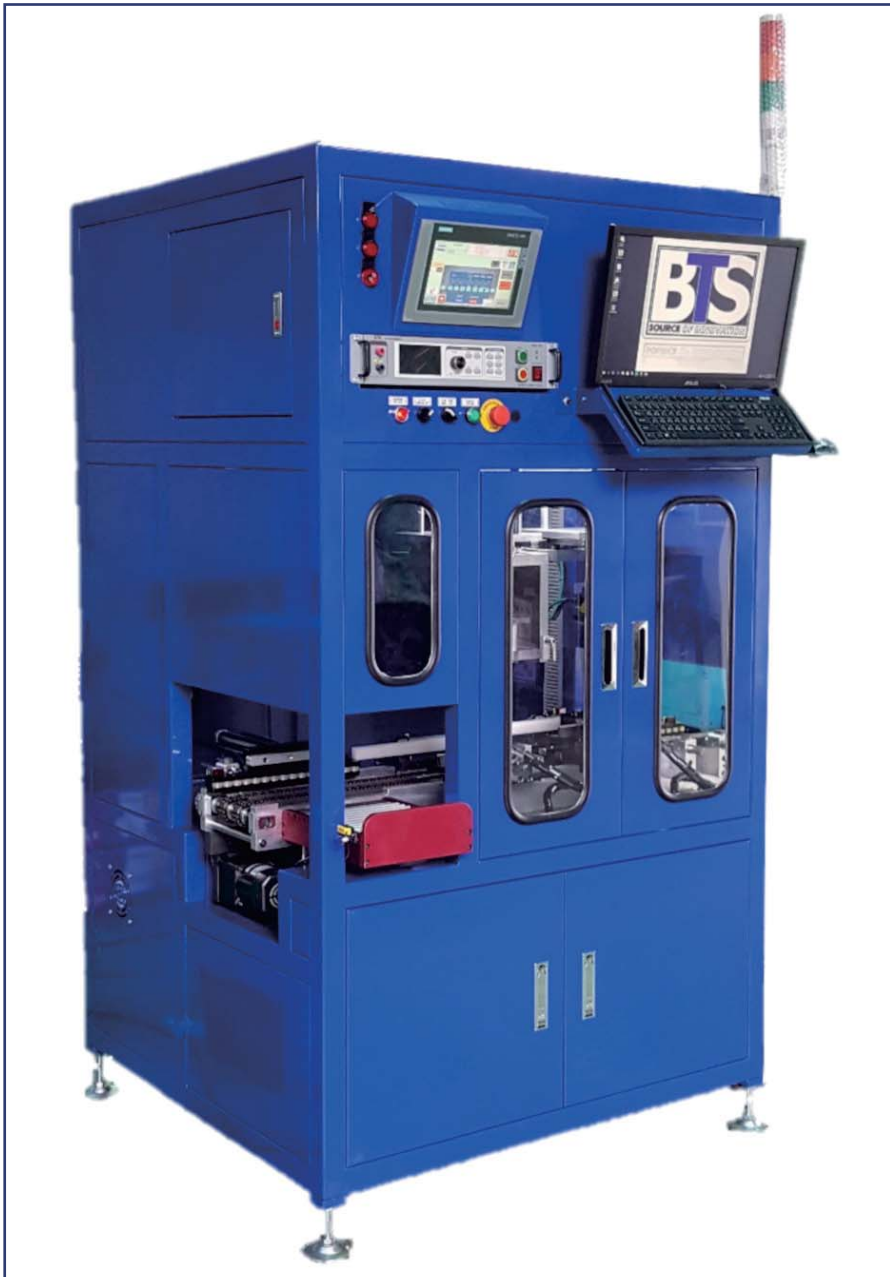
HPVT-10AM (CCD) Automatic polarity and short-circuit test machine