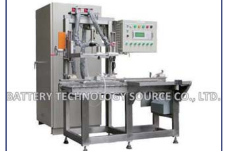
BHRD-1000A-AC Automatic battery high rate inspection machine