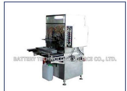
HAF-10AB Acid bottle filling machine