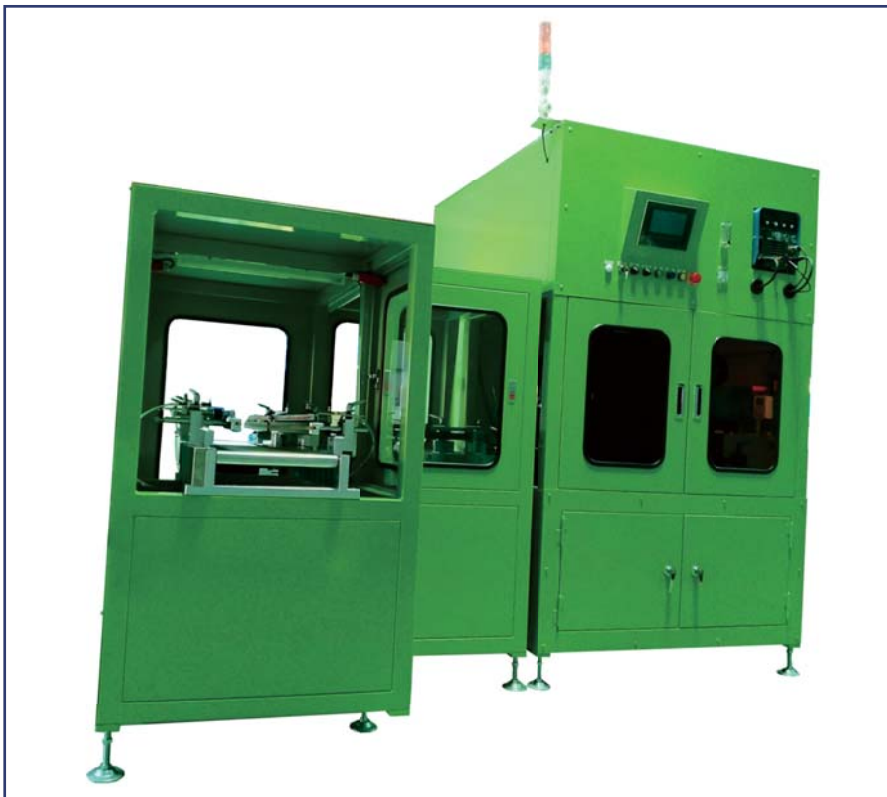
TIG-20AC Automatic pole height adjustment and TIG welding machine