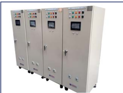
NT2CCDR300/50 Multi-function charger and discharger