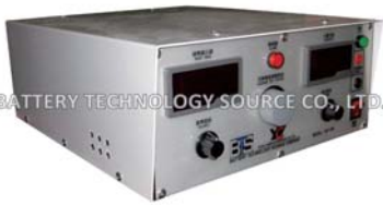
HVT-100 Portable short circuit tester