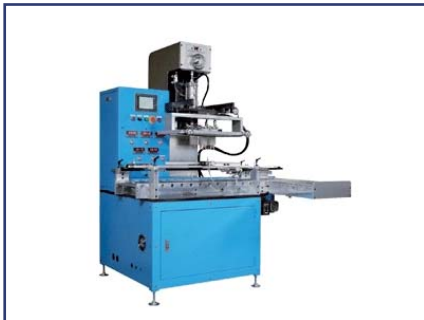
IRT-10AC Automatic internal resistance test machine