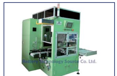
HV-10AC Automatic inter-cell welding machine