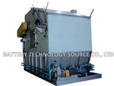
BIGO-10 Inert gas oven for negative plates